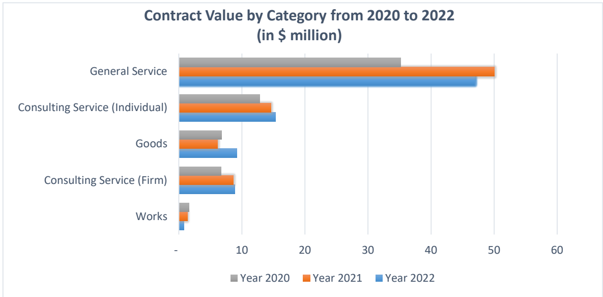
Chart 1: Contract Value by Category From 2020 to 2022 (in USD)